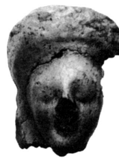
FIG. 4 – CYRENE, TERRACOTTA FIGURINE. Head from a seated female, UM 76-420.