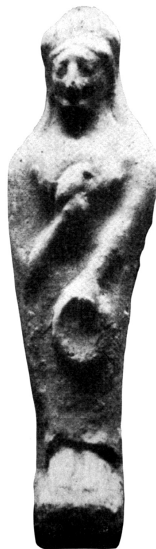
FIG. 15 – SELINUS, TERRACOTTA FIGURINE. Standing female with bird and wreath (from Gabrici, NSc, fig. 29).