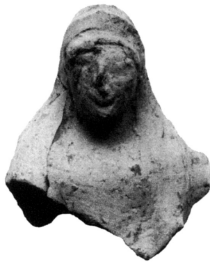
FIG. 3 – CYRENE, TERRACOTTA FIGURINE. Head from a seated female, UM 78-350.