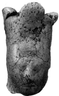
FIG. 6 – CYRENE, TERRACOTTA FIGURINE. Head from a seated female, UM 77-71.