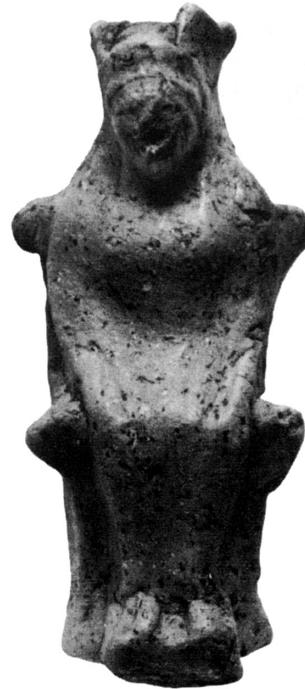
FIG. 5 – CYRENE, TERRACOTTA FIGURINE. Seated female, UM 74-397.