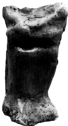
FIG. 10 – CYRENE, TERRACOTTA FIGURINE. Body fragment from a seated kourotrophos , UM 76-937.