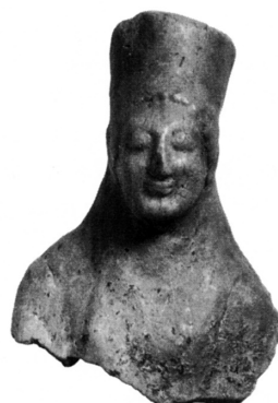
FIG. 13 – CYRENE, TERRACOTTA FIGURINE. Head from a seated female, UM A418.