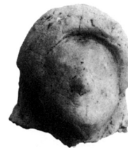
FIG. 7 – CYRENE, TERRACOTTA FIGURINE. Head from a seated female, UM 77-633.