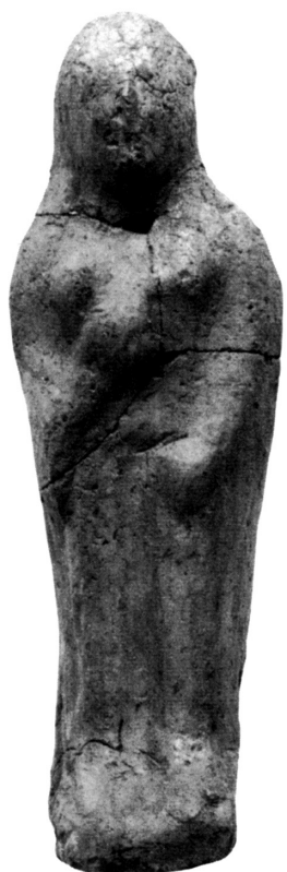
FIG. 8 – CYRENE, TERRACOTTA FIGURINE. Standing female with bird and wreath, UM 74-331.