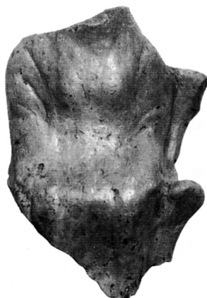
FIG. 12 – CYRENE, TERRACOTTA FIGURINE. Body fragment from a seated female, UM 76-823.