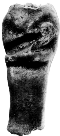
FIG. 9 – CYRENE, TERRACOTTA FIGURINE. Seated kourotrophos , UM 76-333.