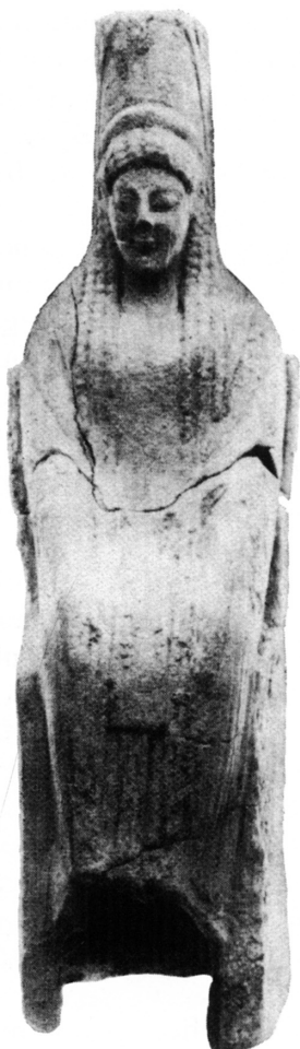
FIG. 11 – ELORÒ, TERRACOTTA FIGURINE. Seated female, (from Pelagatti-Voza, no. 389).