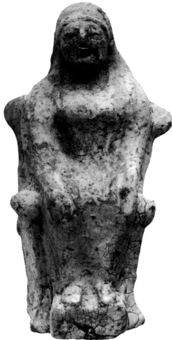
FIG. 2 – CYRENE, TERRACOTTA FIGURINE. Seated female, UM 73-974.