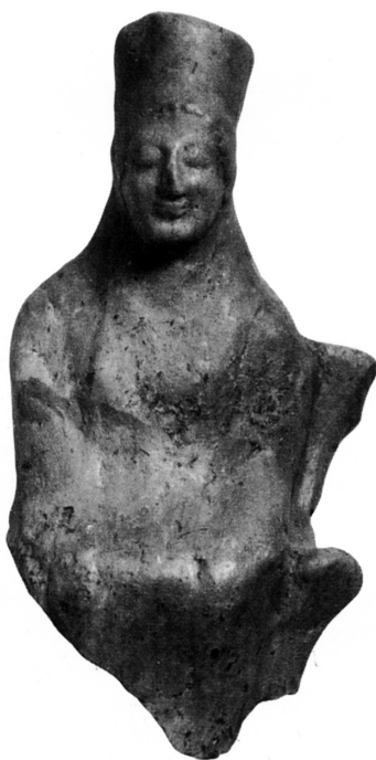
FIG. 14 – COMPUTER MONTAGE, TERRACOTTA FIGURINE. Seated female.