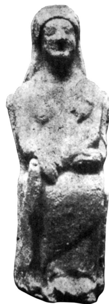
FIG. 16 – SELINUS, TERRACOTTA FIGURINE. Seated kourotrophos (from Gabrici, NSc, fig. 30).